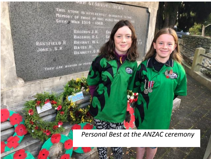
Personal Best at the ANZAC ceremony